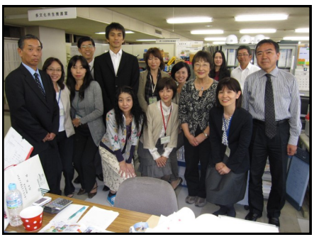
Yoko with Yokkaichi Mayor Tanaka and staff of the Cultural & International Affairs Division