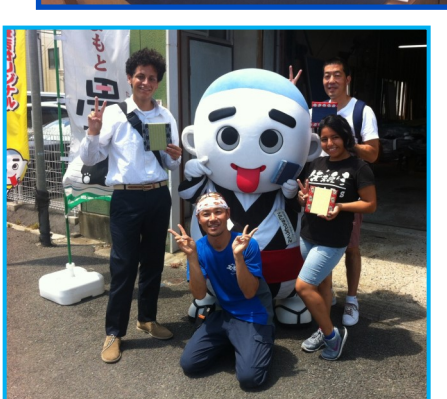
Trio with konyudo-kun (Yokkaichi city's mascot). Kneeling in front: a Japanese floor mat "tatami" maker.