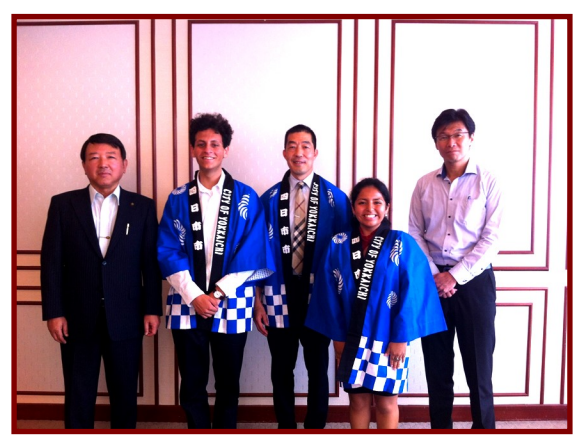
2015 Trio ambassadors meeting Yokkaichi Mayor Toshiyuki Tanaka (left).

represent Long Beach City as a multicultural and progressive city that wants to continue building friendships with neighboring countries and create more Sister Cities.