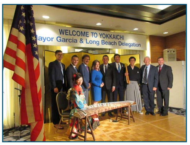
Long Beach Delegation in Yokkaichi

Also present were the Deputy Chairman of the City Assembly, the President of Port Promotion Association, the Chairman of the Chamber of Commerce & Industry, the Director of the Municipal Hospital and the Director of Policy Promotion. The mayors toasted to the longstanding sister city relationship, and over dinner they discussed the importance of strengthening the partnership between Long Beach and Yokkaichi.