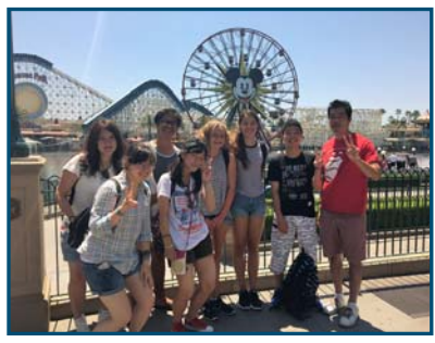
2016 Trio from Yokkaichi with host families.

In alternate years, one teacher and two high school students (16-17) from Long Beach are selected to visit Yokkaichi, Japan as goodwill ambassadors for a threeweek cultural exchange. In alternate years, Long Beach hosts a trio from Yokkaichi.