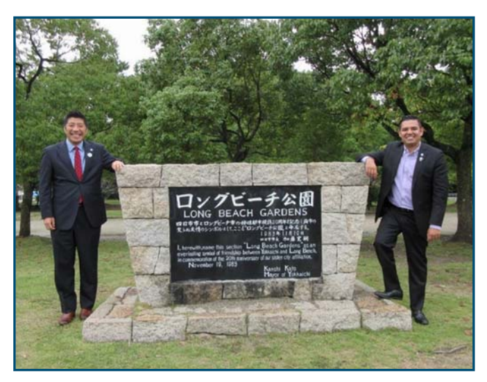
Mayor Mori and Mayor Garcia

Of course, while we were at Long Beach Gardens, we were excited to learn about the vibrant history of the Long Beach-Yokkaichi partnership. We got to see up close the oil pump gifted to Yokkaichi in 1965 to commemorate the sister city relationship.