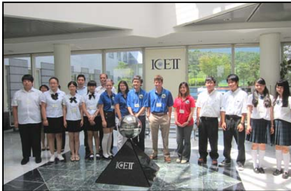
Long Beach team (in blue & red) with Chinese and Japanese students at the International Center for Environmental Technology Transfer (ICETT).

any issues or concerns. We talked about the cultural differences we've experienced, omiyage (gifts) and the importance of interacting with other students. Even though the students will be working together on their presentation, it will be good for them to get to know and learn about each other's cultures.