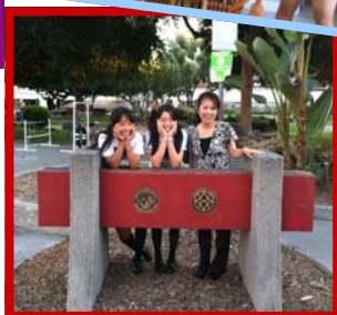
At Lincoln Park to see Sister Cities plaques—gifts from Yokkaichi to Long Beach.