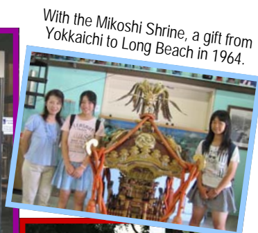
With the Mikoshi Shrine, a gift from Yokkaichi to Long Beach in 1964.